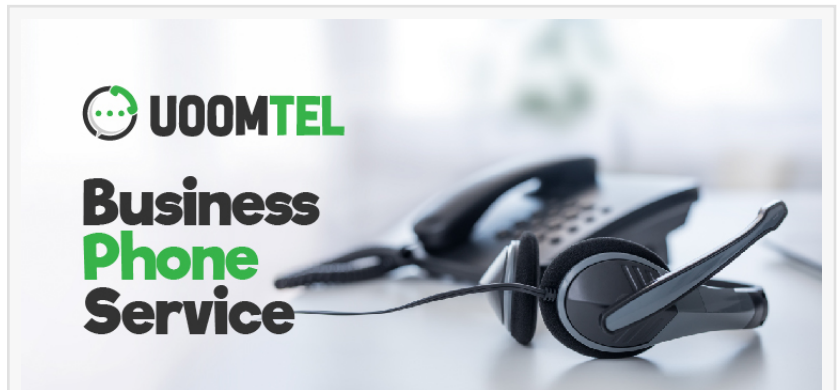
UOOMTEL-Business Phone Service

Before transitioning to Uoomtel, Medical Valor was facing challenges with its existing communication system. They needed a solution that could seamlessly manage the high call volumes, deliver superior call quality, and offer flexibility and scalability to meet the ever-