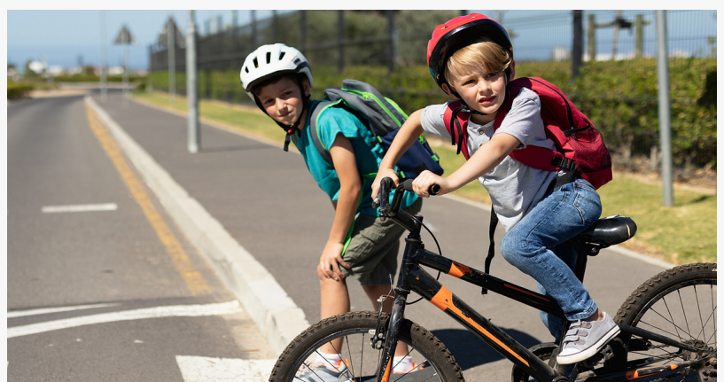
School Zone Speeds can now be monitored by NovoaGlobal safety camera technology

NovoaGlobal, Inc. , a leading Florida-based Photo Enforcement company, is pleased to announce Governor DeSantis signed into law HB657: Enforcement of School Zone Speed Limits allowing communities to install photo enforcement in school zones to enforce unlawful speed violations.