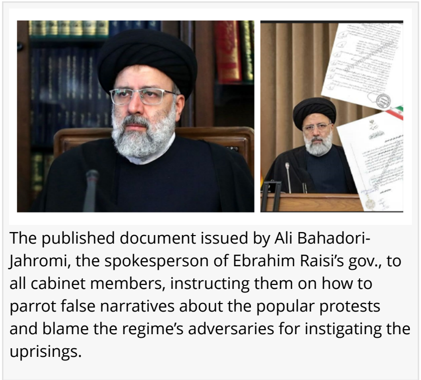
The published document issued by Ali Bahadori-Jahromi, the spokesperson of Ebrahim Raisi’s gov., to all cabinet members, instructing them on how to parrot false narratives about the popular protests and blame the regime’s adversaries for instigating the uprisings.

In his letter to cabinet members, Bahadori Jahromi underlines to “Provide full and comprehensive support for the military and police forces while condemning any actions that weaken the country’s security and condemn attacks against the IRGC, Basij, army, and police forces.”