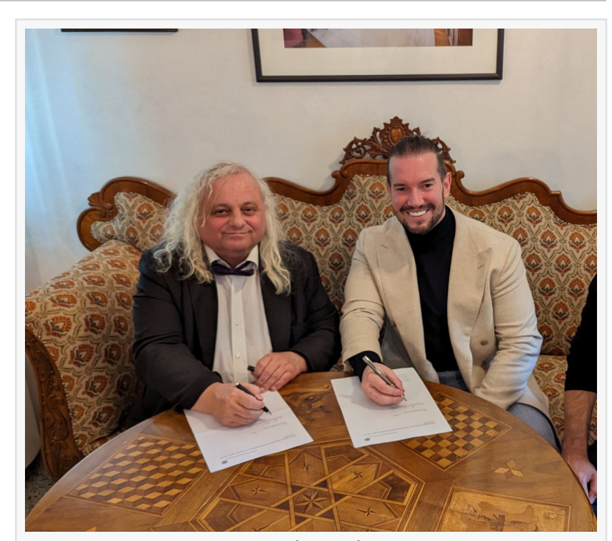
Signing an agreement with Liechtenstein

The Rare Antiquities, a trailblazing project that promotes global art and culture, announced today that it has signed a Memorandum of Understanding (MoU) with Liechtenstein National Museum to