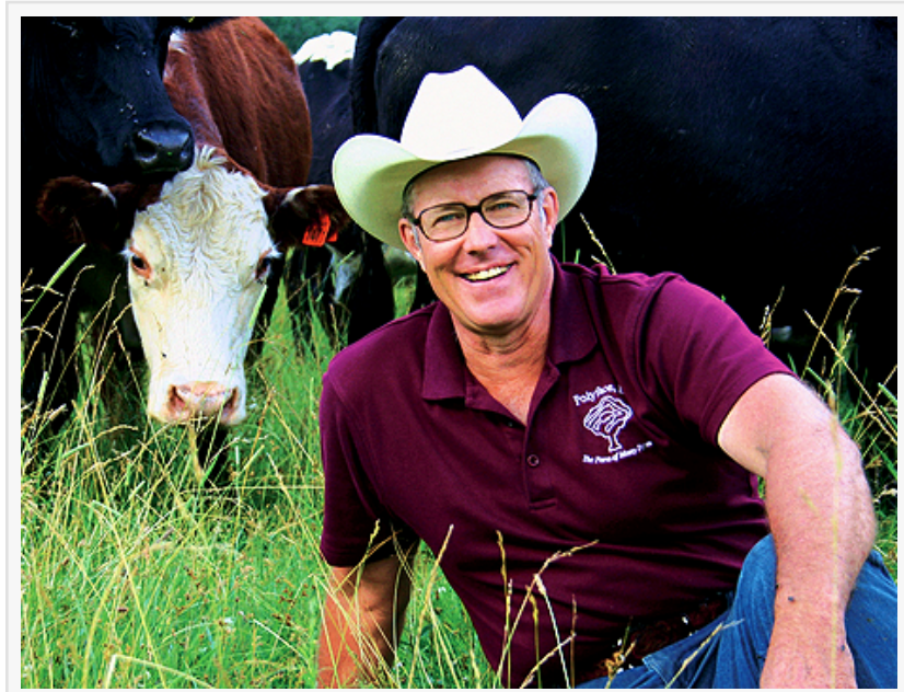
Joel Salatin is a renowned expert in organic farming and food sustainability

Under the Seed and Soil, attendees will learn about fertilizer, herbs, seed saving, soil recovery, freeze drying, and composting. An Amish Country category will have timber framing,