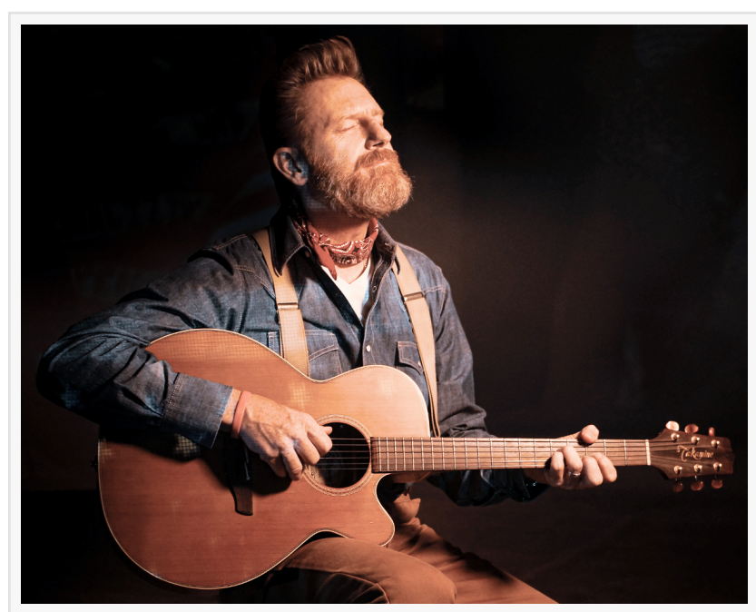
Rory Feek performs free concert for Food Independence Festival

Frustrated by rising food costs and supply chain disruptions, a growing number of urban families are digging up their backyards and planting