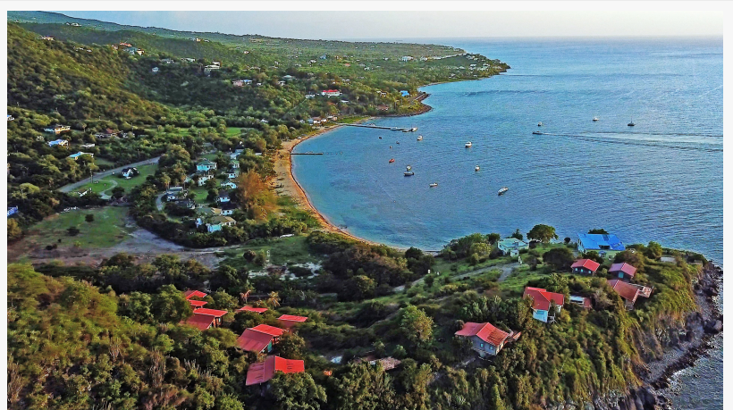
Serenity Cove | 6 Acres

But there is a small airport where private jets fly in and out, and a sheltered coastline where