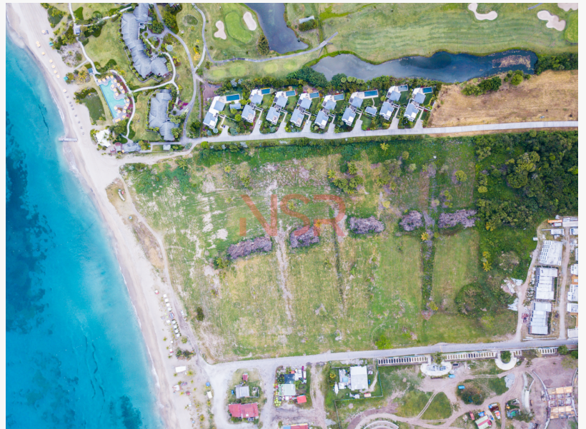
Pinney's Beach | 20 Acres