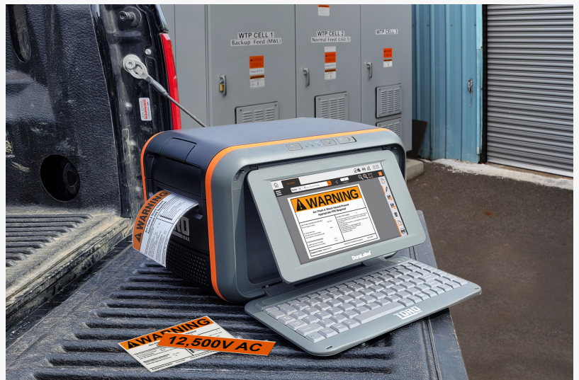
The Toro Max portable sign and label printer delivers safety on the go.