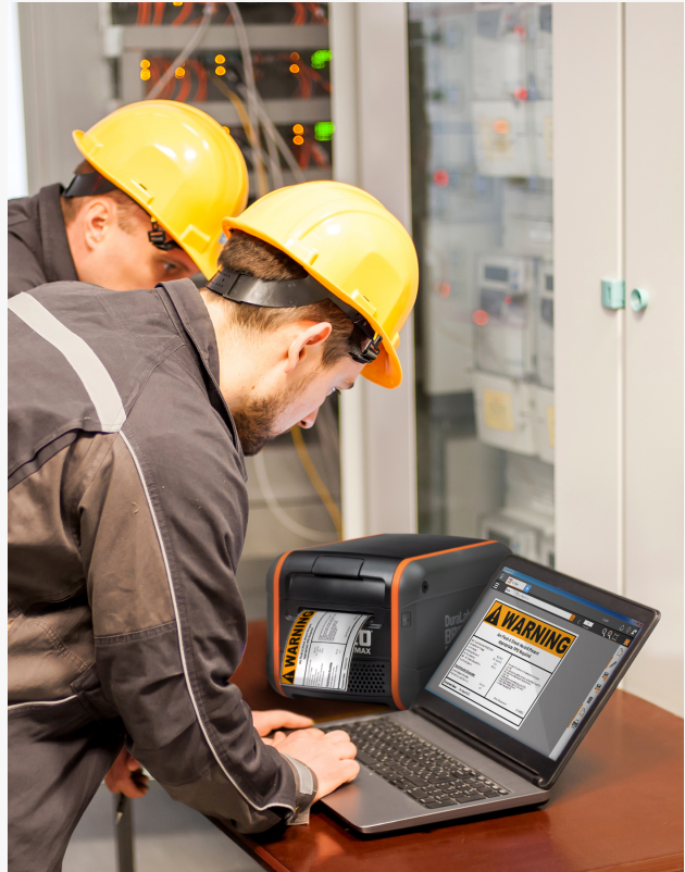
Design and print custom labels for any facility safety needs with LabelForge PRO. Includes Arc Flash and GHS/HazCom database.

For more than 50 years, DuraLabel and its parent company Graphic Products have delivered innovative labeling software, industrial sign and label printers, multi-use floor marking, ready-made signs and labels, and heavy-duty pipe and duct markers for any facility's compliance and safety requirements. DuraLabel backs up its products with world-class support and warranties. Learn more about how DuraLabel products enhance safety and efficiency at