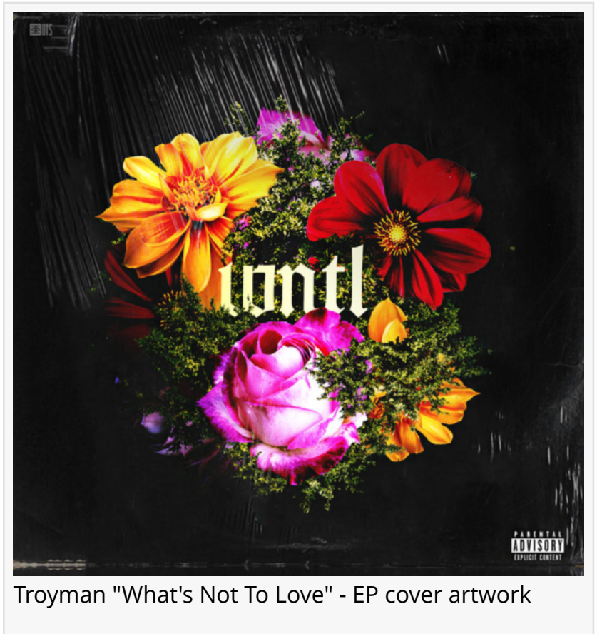
Troyman "What's Not To Love" - EP cover artwork

This press release can be viewed online at: https://www.einpresswire.com/article/638195132