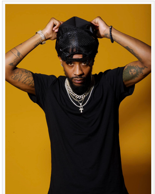
Troyman - American artist/ singer/ songwriter/ record producer / actor