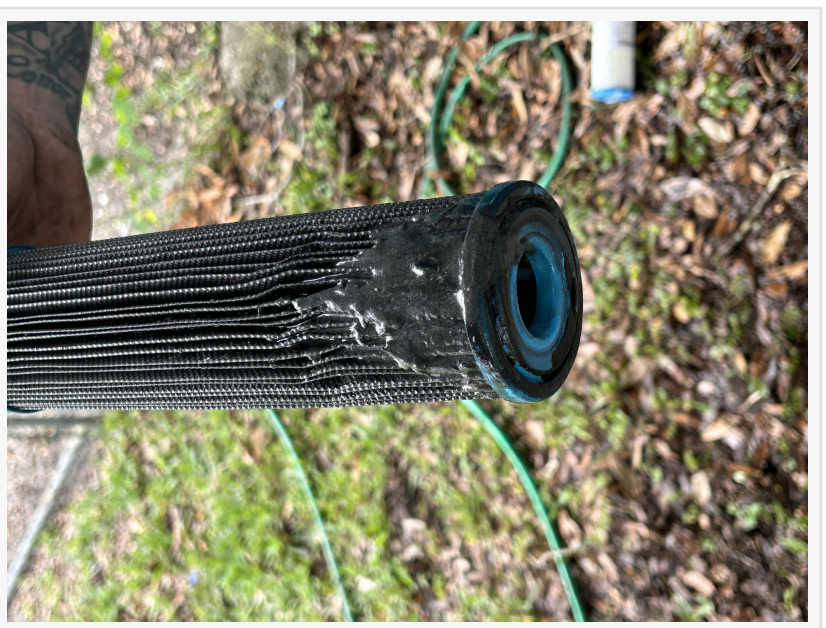
Needed of Sediment of Filter Replacement

3. Advanced Treatment Techniques -PSL Water Guy uses advanced treatment techniques and equipment to remove contaminants from well water sources, including bacteria, viruses, chemicals, and other harmful substances. The team's goal is to ensure that clients have access to clean, safe, and healthy well water.