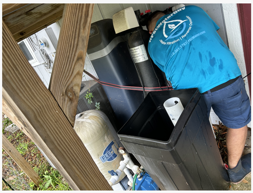
Lakewood Park Triple Install

4. Ongoing Maintenance and Support - Great well water treatment does not end with the installation of a treatment system. At PSL Water Guy, the team offers ongoing maintenance and support services to ensure that clients' well water treatment systems operate at optimal efficiency and effectiveness.