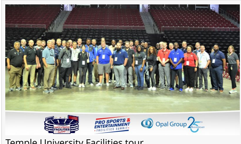
Temple University Facilities tour

The Pro Sports & Entertainment Facilities Summit (PSEFS) presents an excellent opportunity for executives