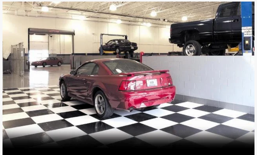
The Don Hinds Ford Body Shop is capable of fixing up that chipped paint job, dents scratches and any other minor cosmetic repairs.