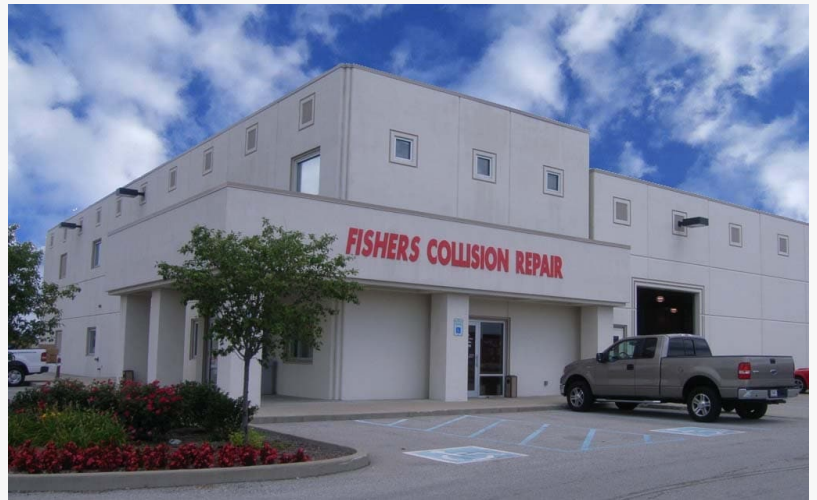
Don Hinds Ford, Inc. has a full service Collision Center equipped with ASE certified technicians.

Body shops typically do cosmetic repairs such as windshield repairs, paint jobs, dents, fender