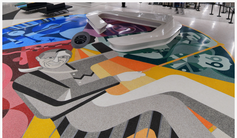
Will Rogers is honored in one of the award-winning terrazzo medallions.