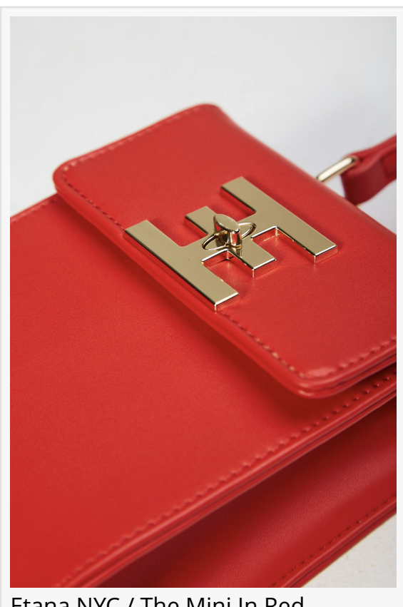
Etana NYC / The Mini In Red

ETANA NYC invites fashion lovers to explore the new collection exclusively at Kreyol Store and indulge in the brand's exquisite designs.