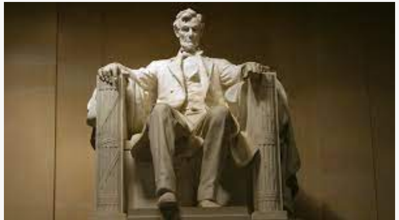
The Lincoln Memorial in Washington, D.C.