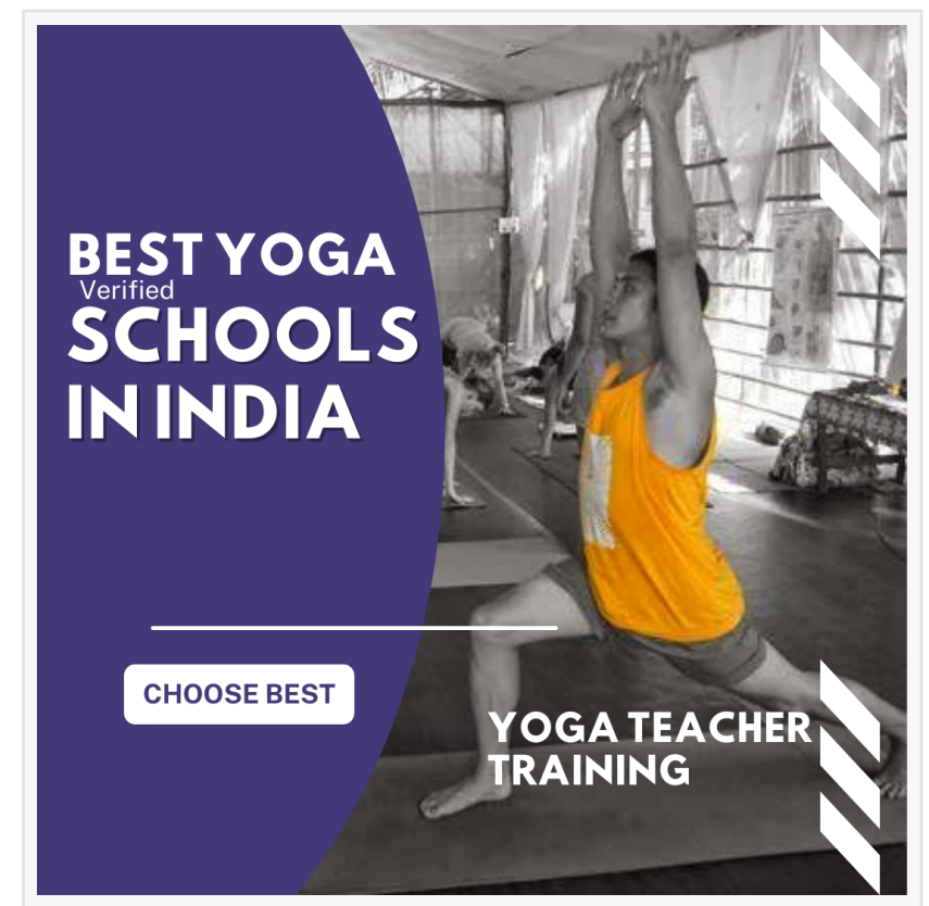
This image will just give an idea for the yoga verified indian school

Discover the transformative yogic journey at Rishikesh Yogis Yog shala in the tranquil setting of Rishikesh, India. Offering registered 200-hour, 300-hour, and 500-hour yoga teacher