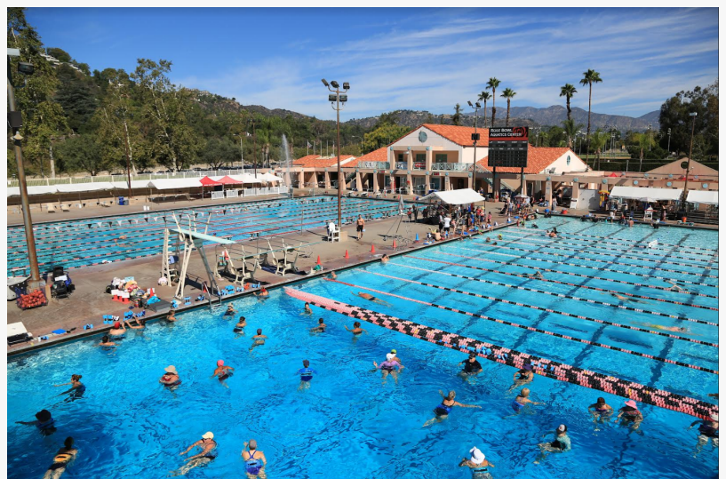
Rose Bowl Aquatics Center image of pools and deck

announces the celebration of its 33rd anniversary, marking over three decades of providing outstanding aquatic programs and services to the community. The center has been a vital part of Pasadena and nearby areas since 1990. Its robust programming is rooted in water safety education, youth development, and a supportive aquatics and wellness community.