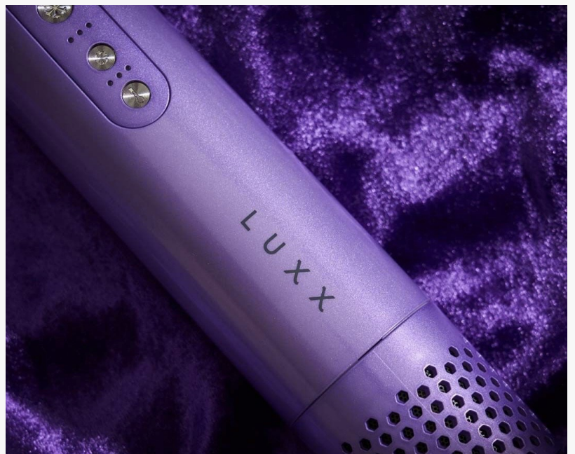
Experience professional-level styling with the versatile Air Styler Luxx Air Pro 2 Amethyst