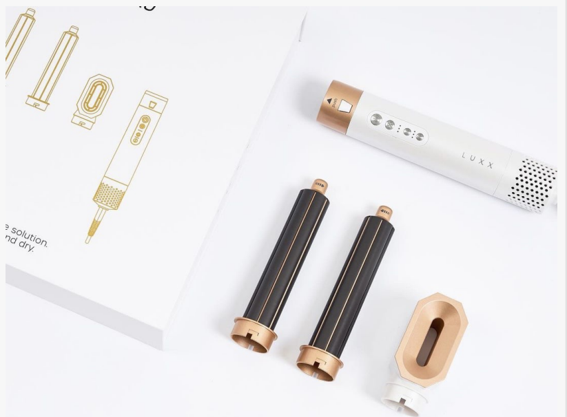
Luxx Air Pro 2 Lite - Professional Performance in a Compact Size