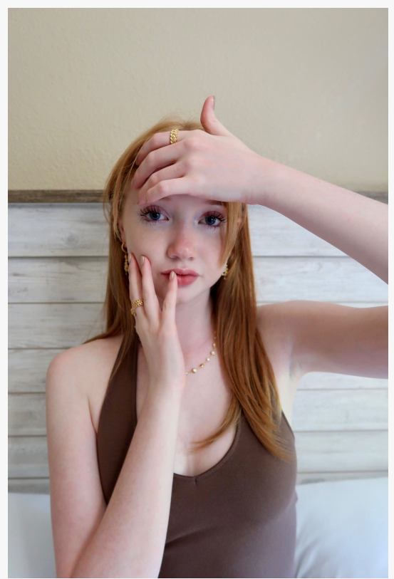
Life with Mak design Life With MaK Honeycomb & "Bee" kind Jewelry Set at www.trendollajewelry.com

This press release can be viewed online at: https://www.einpresswire.com/article/638563322