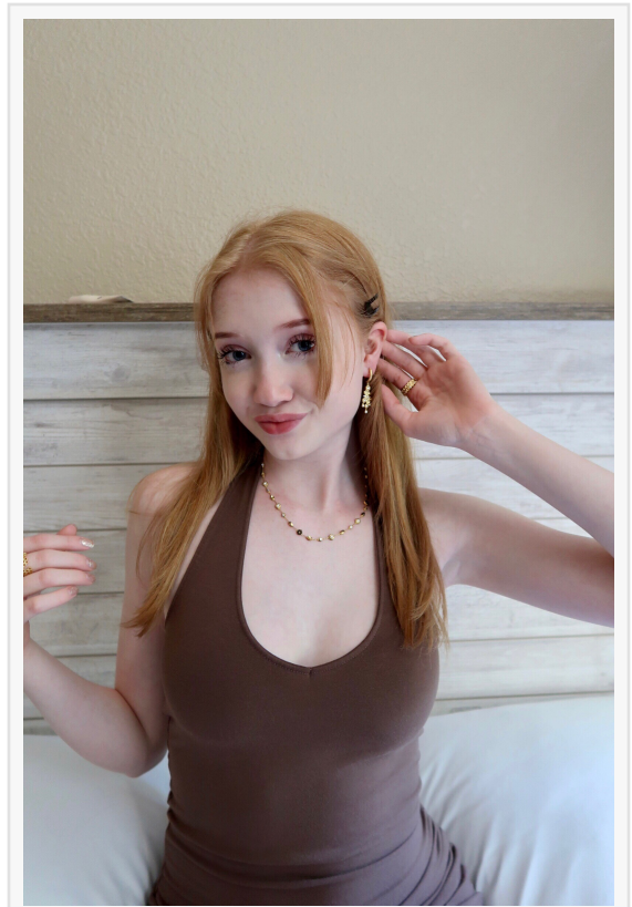
Life with Mak design Life With MaK Honeycomb & "Bee" kind Jewelry Set at www.trendollajewelry.com