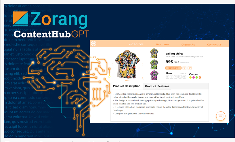
Zorang Generative AI solution

automate the creation of compelling and accurate product content at scale, ensuring consistency across multiple channels, languages, and regions.