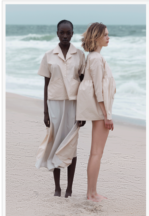
NISH NICHE is a small, contemporary atelier located in New York City.

"The combination of these influences results in effortless silhouettes that possess universal appeal and are suitable for individuals of all ages. Our relaxed fit ensures comfort and ease of wear, allowing our customers to feel confident and stylish."