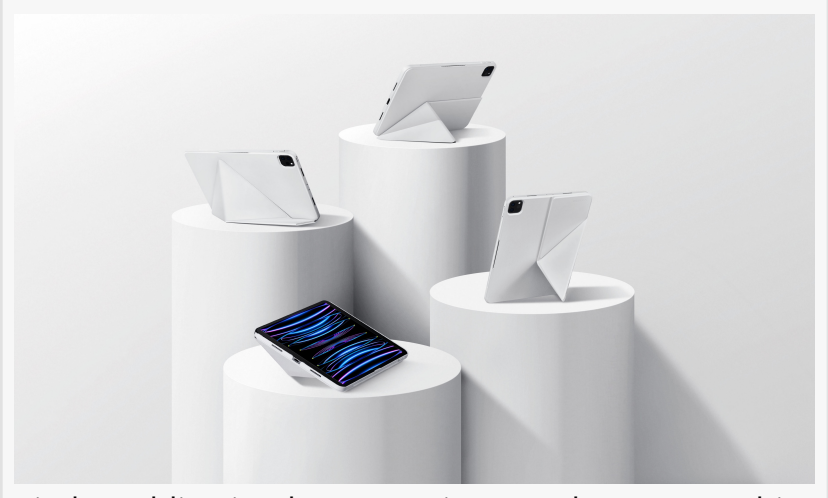
Pitaka Folding iPad Pro Premium Leather Cover_white