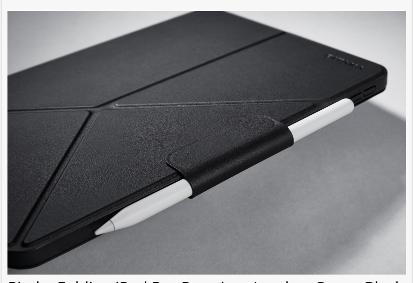
Pitaka Folding iPad Pro Premium Leather Cover_Black