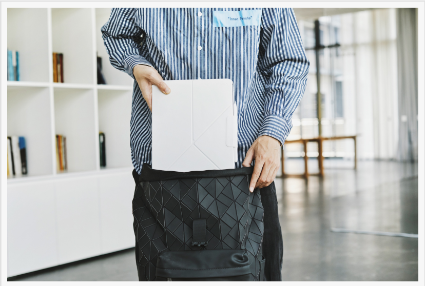
Pitaka Folding iPad Pro Premium Leather Cover

Michael Wesolowski 5 Star Review 04/04/2023