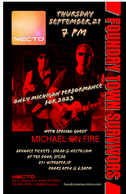
Live at the Necto

This press release can be viewed online at: https://www.einpresswire.com/article/638925702 Visit us on social media: