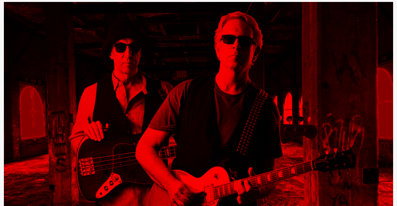
Foundry Town Survivors

Jazz Festival and The Olympics. As Foundry Town Survivors, they return to their roots with a rare Michigan concert appearance this year at the Necto on September 21.