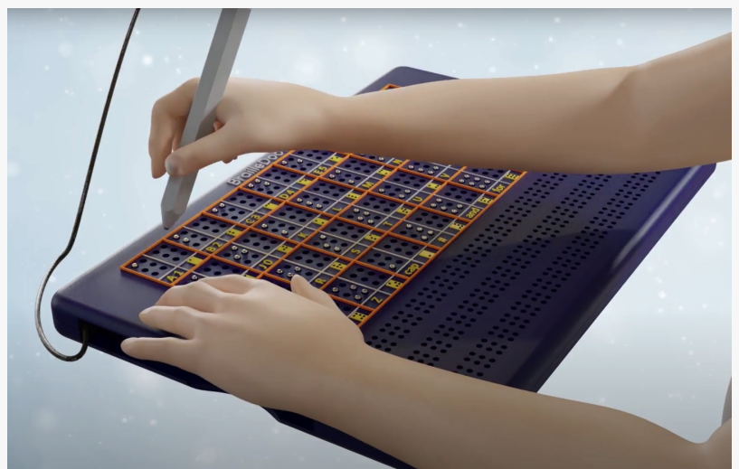
A boy's hands makes braille on the BrailleDoodle

The BrailleDoodle Kickstarter , happening right now, allows ordering or donating the device for only $75. The TouchPad Pro Foundation was happy to report they have pre-sold 385 BrailleDoodles to 16 countries worldwide and generated over $30,000 in sales.