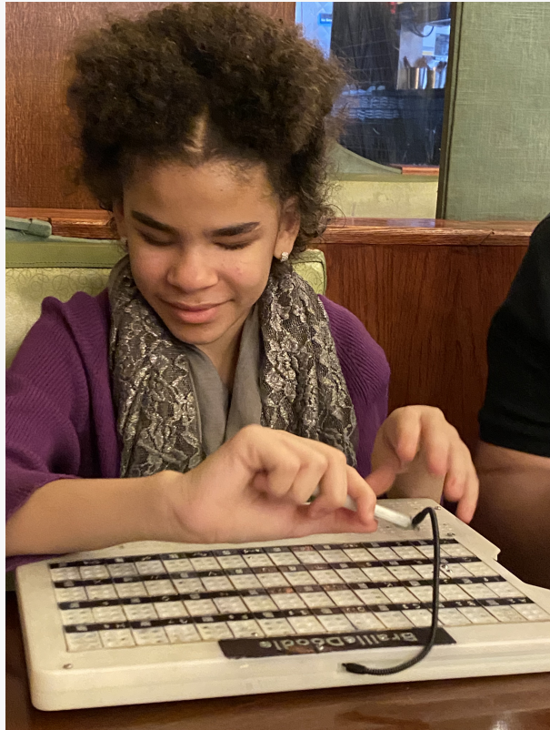
Millie and the BrailleDoodle

The BrailleDoodle Kickstarter , happening right now, allows ordering or donating the device for only $75. The TouchPad Pro Foundation was happy to report they have pre-sold 385 BrailleDoodles to 16 countries worldwide and generated over $30,000 in sales.