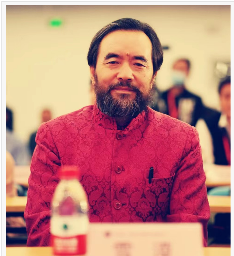
Speaker -Xue Mo

Renowned writer Xue Mo delivered a keynote speech "The Essence of Humanistic Spirit" at the unveiling ceremony of "Xue Mo Center for Chinese Literature Translation" held at the School of Foreign Languages, Ningbo University on June 6th 2023.