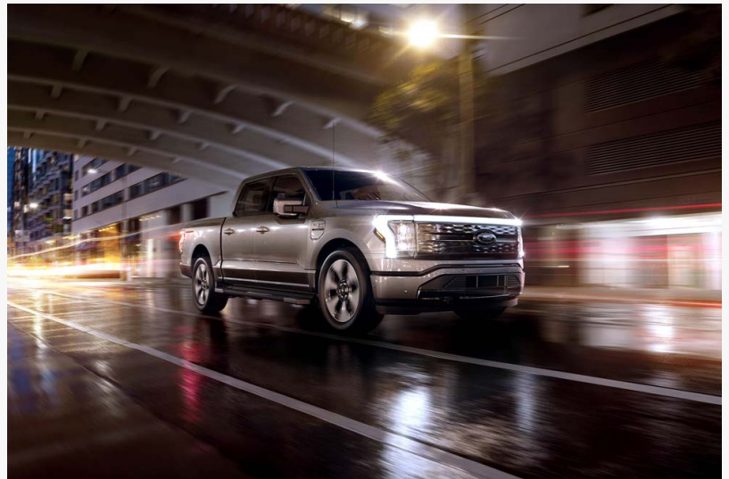
Ford's 1st All-Electric Truck: The F-150® Lightning

One of the company's notable achievements in regard to automotive digital marketing is the resounding success of Don Hinds Ford, Inc., a family-owned and operated Ford dealership located in Fishers, Indiana. Once confined to the limits enforced by approved vendors and the cookie-cutter advertising assets they provide, Don Hinds Ford, Inc. was able to greatly improve their sales thanks to the help of proven search engine optimization techniques and beneficial automotive PPC campaigns.