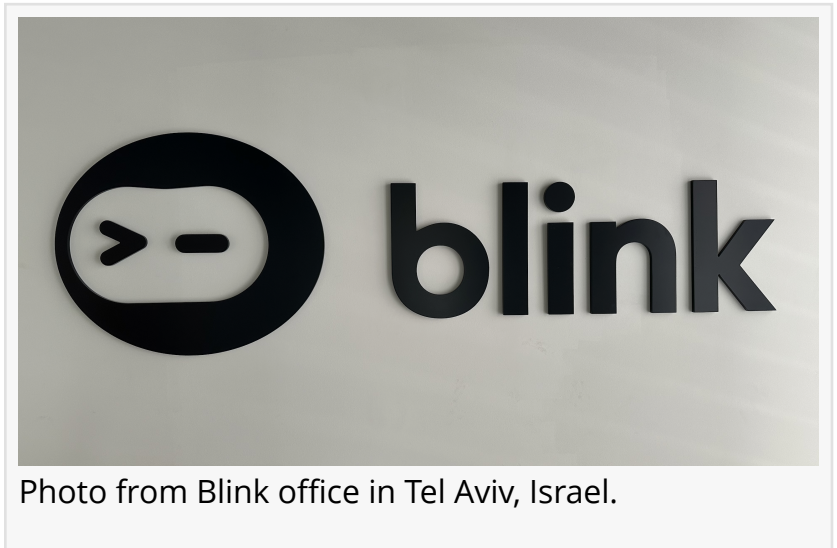
Photo from Blink office in Tel Aviv, Israel.

TEL AVIV, ISRAEL, June 13, 2023 /EINPresswire.com/ -- Blink Ops, creator of Blink Copilot for security workflow automation, today announces its partnership with leading cloud security provider Wiz as the company unveils Wiz Integration (WIN). Blink was hand selected as a launch partner, and brings the power of Blink Copilot generative AI to WIN, so that customers can seamlessly integrate Wiz into their existing workflows.