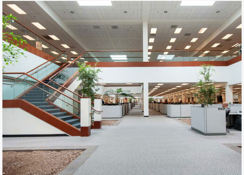
Interior lobby photo of 450 American Street in Simi Valley, California

Interested parties are encouraged to contact Anvers Capital Partners or Peak Commercial for further details on this exclusive listing. The sale of 450 American provides an opportunity to inherit a symbiotic relationship with a stable tenant and enjoy strong in-place cash flow while acquiring a prime asset in the heart of Simi Valley.