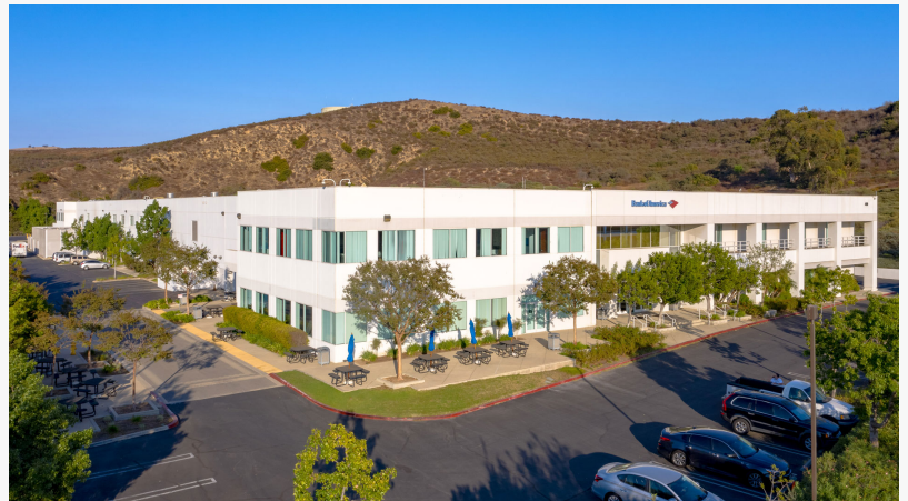
Exterior photo of 450 American Street in Simi Valley, California

SIMI VALLEY, CALIFORNIA, U.S., June 13, 2023 /EINPresswire.com/ -- Anvers Capital Partners ( anverscp.com ) of Peak Commercial, a leading commercial real estate brokerage in Southern California, has announced the listing of a prominent Bank of America office building located at 450 American Street in Simi Valley, California. The property presents a remarkable investment opportunity in a highly sought-after area of Los Angeles County.