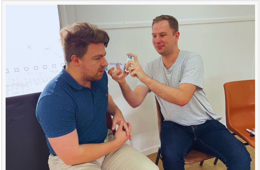
Many First Aid Courses in Brisbane include knowledge and practical training in Asthma first aid.

General Manager My First Aid Course Pty Ltd