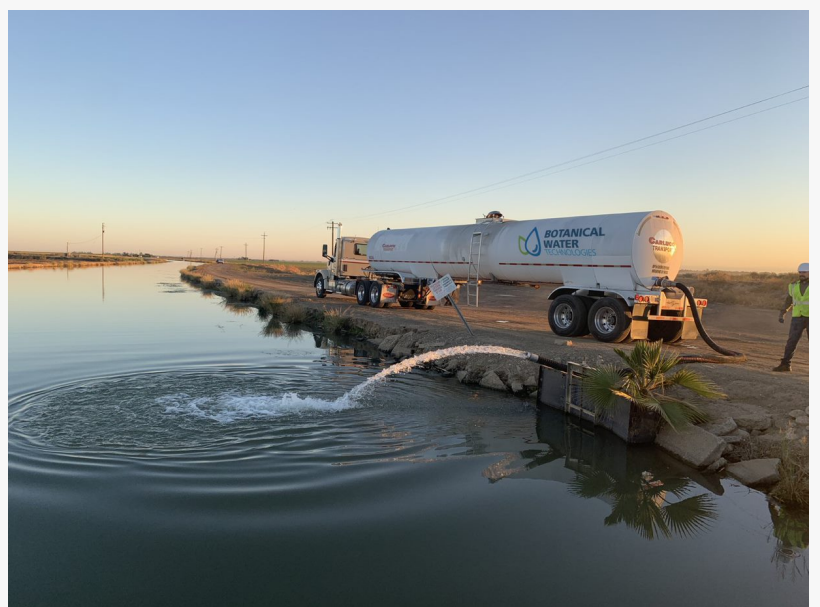
Botanical Water Technologies, Hyperlocal Replenishment Project in California

Discover the benefits and challenges of a hyperlocal approach in water stewardship programs, and the opportunity for corporates and governments to sponsor projects with Botanical Water Technologies' (BWT) decentralised water ecosystem, providing sustainable drinking water to those who need it most.