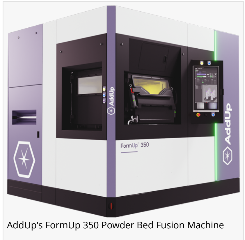
AddUp's FormUp 350 Powder Bed Fusion Machine

/EINPresswire.com/ -- Interoperability is a strong expectation for industrials who plan on taking Additive Manufacturing (AM) to a daily large-scale level. It connects not only a single machine to a global industrial environment, but also offers digital continuity and simplification for upstream production processes. In other words, it's the key to efficiency, of which the AeroPrint project will be the first beneficiary.