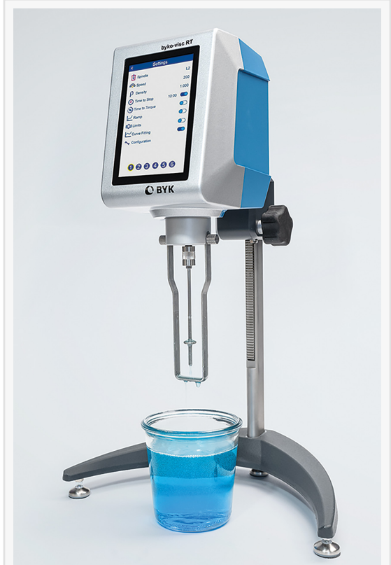
byko-visc RT Viscometer Rotate and Flow through Thick and Thin

Available in two models, the byko-visc RT Premium and byko-visc RT Lite , each feature versatility and compatibility with three different sensitivities and optional accessories. Measuring viscosity – lacquers, paints, primers, resins, lubricants, pharmaceuticals, creams, lotions, liquids soaps, beverages, dressings, sauces from a near water-like, very