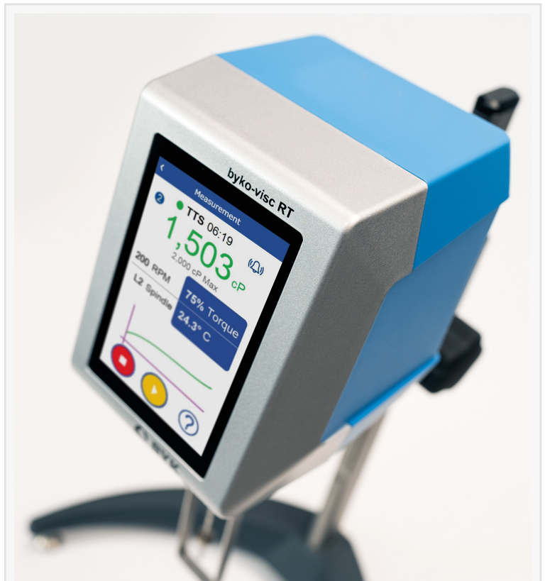
The byko-visc RT offers a large capacitive, color touch-screen display