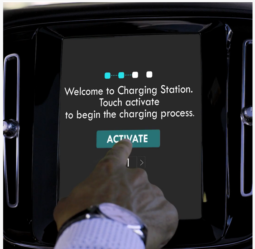
Sheeva.AI activating an EV charger from inside the car