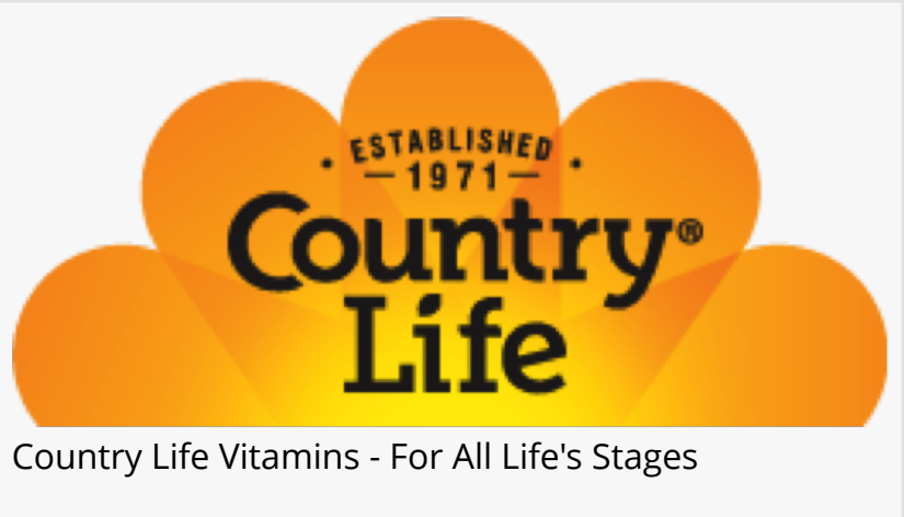
Country Life Vitamins - For All Life's Stages

increase resting energy metabolism, reduce body fat, abdominal fat, waist size and visible cellulite, as well as target stubborn areas such as the belly, waist, and hips.**