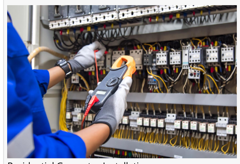
Residential Generator Installation

or hurricane. By professionally installing a generator, homeowners can maintain electricity in their homes, ensuring the safety and comfort of their families throughout an outage.