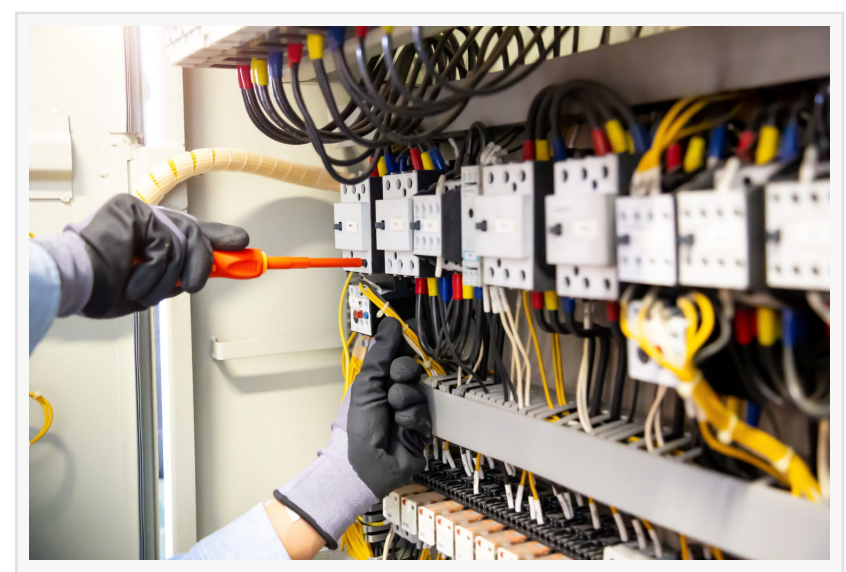
Commercial Generator Installation

As part of their commitment to superior service, My Electrician offers a wide selection of high-quality generators from reputable manufacturers. The company only partners with trusted brands renowned for their reliability, durability, and performance. By utilizing the latest and most advanced generator technologies, My Electrician ensures that homeowners receive the best-in-