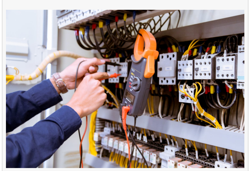
Electrical Services in Port St Lucie