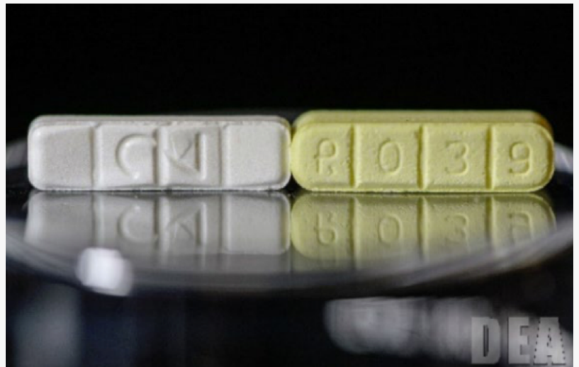
Authentic Xanax tablets (white) vs. counterfeit Xanax tablets containing fentanyl (yellow)

/EINPresswire.com/ -- As fatal drug overdoses continue to rise each year, so do concerns and questions about what we can do to reverse this alarming trend that began a decade ago. The Foundation for a Drug-Free World offers answers in the form of information kits and educator packages for teachers, school administrators, mentors, school counselors, law enforcement officers and juvenile correctional officers. Correct facts and knowledge are the first step to prevention.