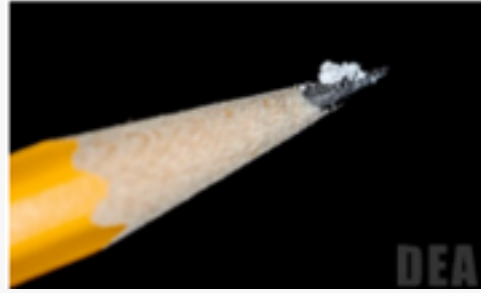
A lethal dose of fentanyl

The Hill newspaper reported, "Between 2010 and 2021, the number of