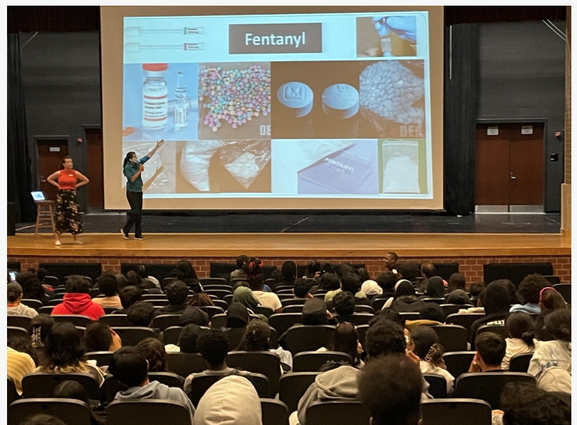
Ms. Ghiglia giving examples of how fentanyl can be hidden in other drugs