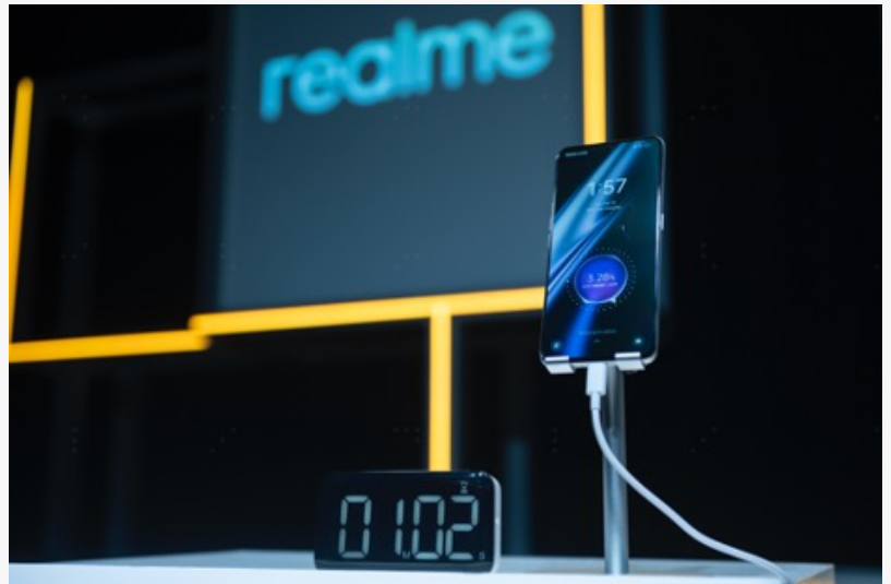
240W: World's Highest Charging Standard