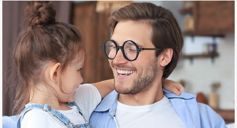
fathers day sunglasses