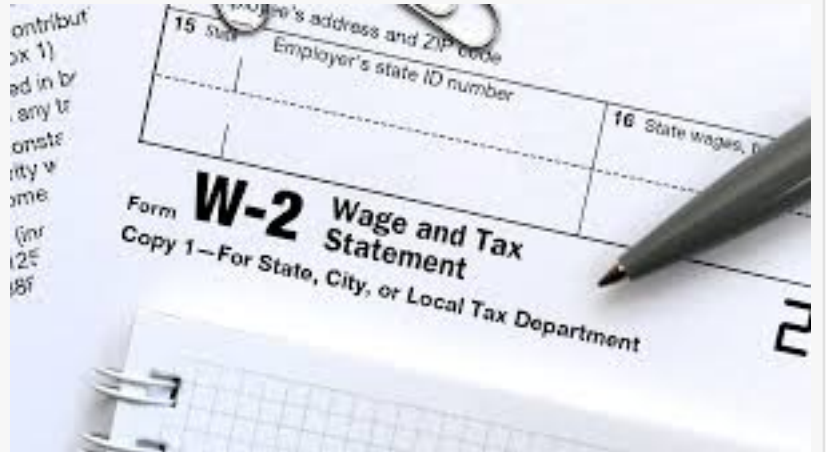
TurboTax W-2 Finder