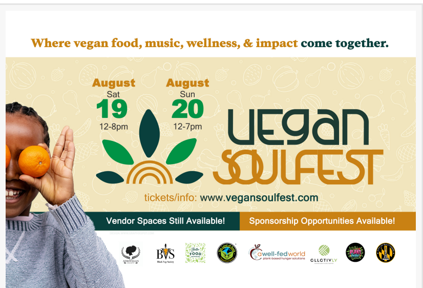
Vegan SoulFest Flyer - Back

Discounts on hotel accommodations are being offered for a limited time through partnerships with Lord Baltimore, The Royal Sonesta, Days Inn, Renaissance Baltimore, and Tru by Hilton. More information can be found on the website at www.vegansoulfest.com . The organizers are seeking financial and product sponsors who share in the vision and mission of Vegan SoulFest.