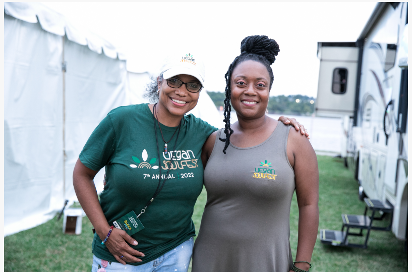
Vegan SoulFest Creators