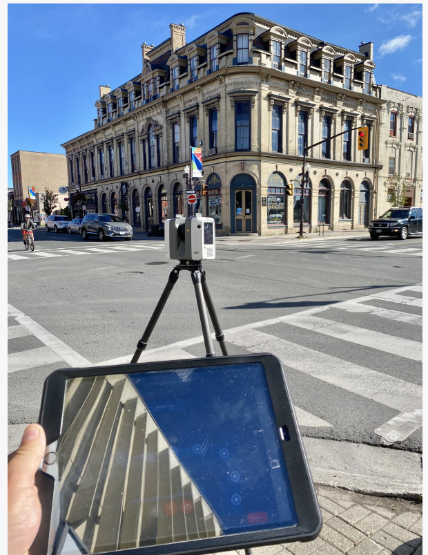
3D scanning services1

3D scanning has become an invaluable tool for construction teams, offering enhanced precision, improved safety, and cost efficiency. By accurately measuring the area of a construction site, teams can set up the job more safely and efficiently with fewer errors. 3D scanners capture millions of data points per second, allowing for rapid results and reducing labor costs significantly.