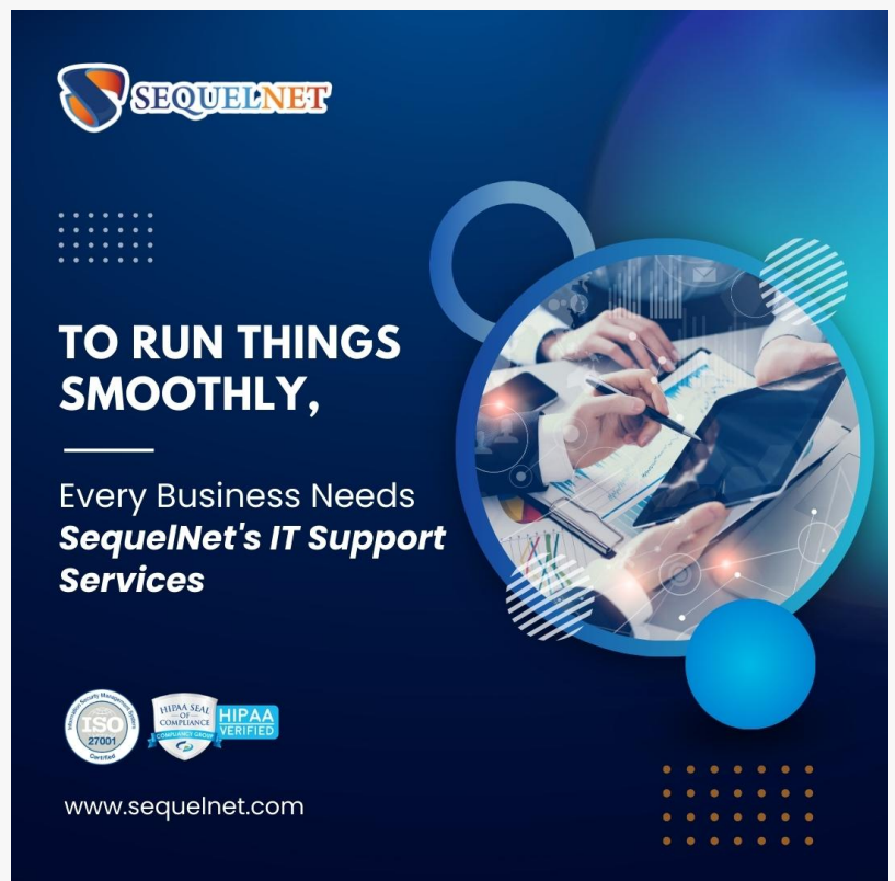
Run Things Smoothly With SQ NET IT Services