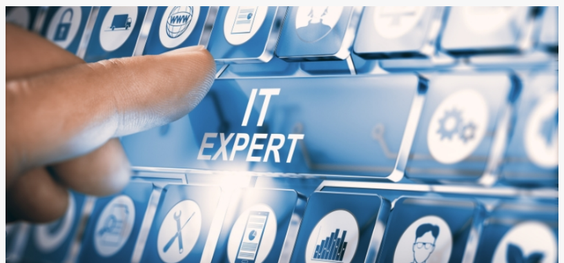
SQ NET - IT Expert

SequelNet's robust security analysis, Rights Active has ensured the safety of its sensitive information. Additionally, the constant spam monitoring and offsite data backup services