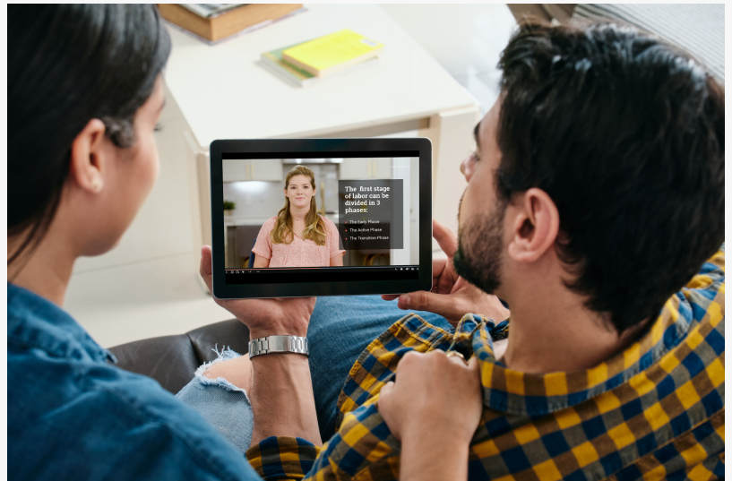
Tinyhood's Baby Care Class Collection

Tinyhood's Baby Care Class Collection focuses on real-life scenarios and is designed to equip new or expecting parents with practical advice and everyday baby care tips. This approach ensures parents and caregivers can react appropriately in different situations to provide the best possible care for their babies.