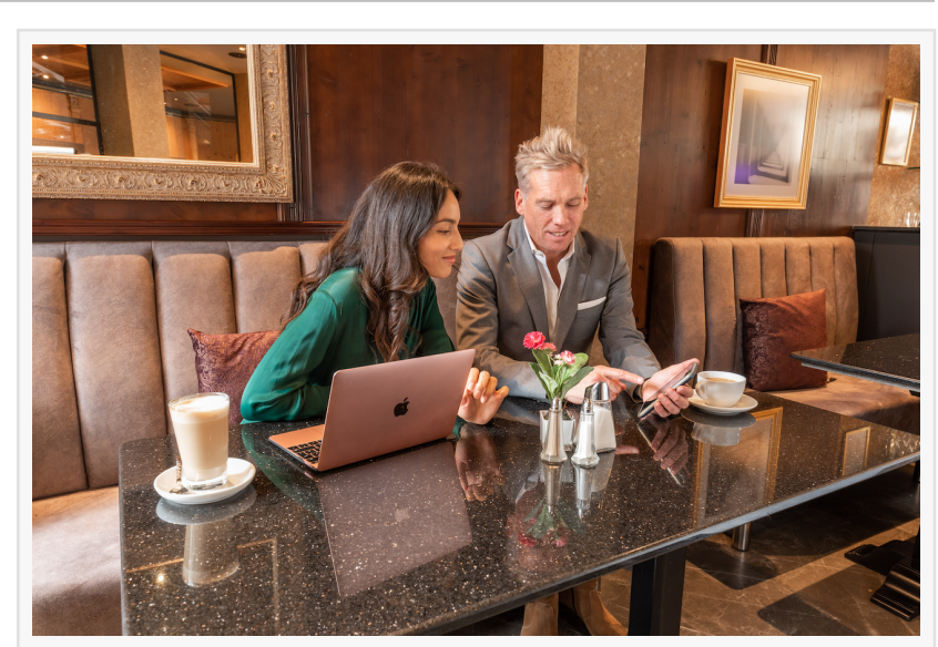
Focus Lounge By King's

MUNICH, GERMANY, June 16, 2023 /EINPresswire.com/ -- KING's Hotels, a prestigious boutique hospitality group in the heart of Munich, is reshaping the future of the sector with the introduction of two innovative concepts: a co-working café and a range of mid- to long-term aparthotel accommodations.