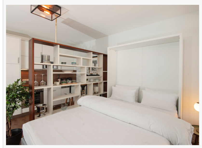
Everything is included to make this a home away from home for mid to long stays!

booking code displayed on our homepage, they benefit from a 10% discount on top."