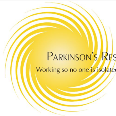
Parkinson's Resource Organization sun logo with slogan

PRO has built a community network that includes caregivers, researchers, physical therapists, elder law attorneys and more. Certified therapists run PRO's movement groups while an end-of-life doula facilitates the grief group. Other professionals lead topics such as mindfulness and caregiving. Donations, like the Berger Foundation grant, allow PRO to provide all of the nonprofit's services at no cost.