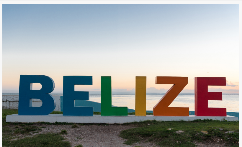
Belize sign in color

□ Inland Small Resort Potential Property: A 4-acre property for $275,000 USD ready to be turned into a private estate with six rental cabins. Located in the western part of Belize, this property is centrally located near multiple Mayan archaeological sites and jungle tours.