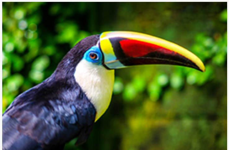
Beautiful closeup of a toucan bird

Located in the western part of Belize, this property is centrally located near multiple Mayan archaeological sites and jungle tours.