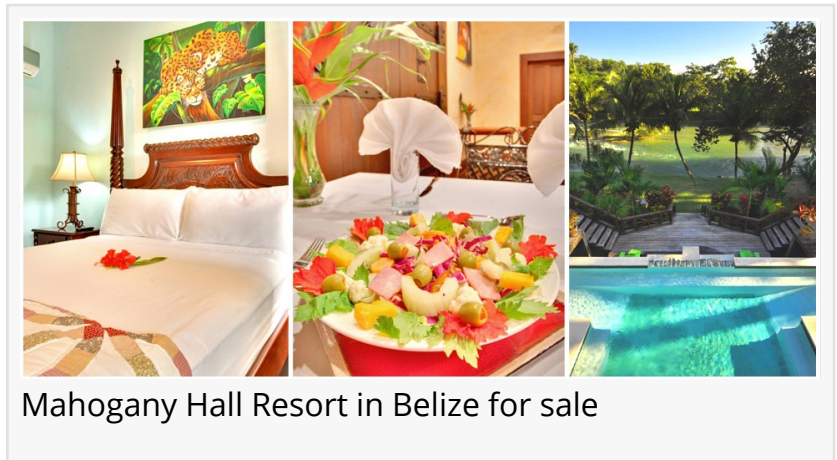
Mahogany Hall Resort in Belize for sale

announced today that it has several new business opportunities for sale to expats looking to invest in new overseas opportunities.