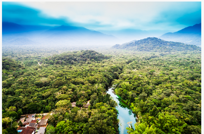
Mopan river and green lush mountain range