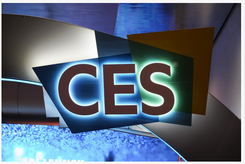
Debuting at CES 2023 in Las Vegas, MoonBikes presents the world's first 100% electric snow bike, revolutionizing winter sports.

Over the course of the past two years, the Just Now Show has emerged as the ultimate chronicler of a myriad of events, beating at the very heart of entertainment journalism. It vividly