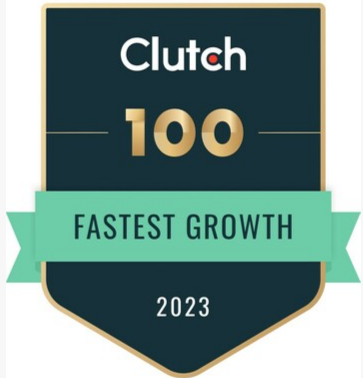
Clutch Top 100

Ganguly. "Business service providers play a key role in the global economy in that they also greatly contribute to their clients' growth. These 100 businesses have profound second-order impact across the world thanks to the project outcomes they've delivered for their clients. By