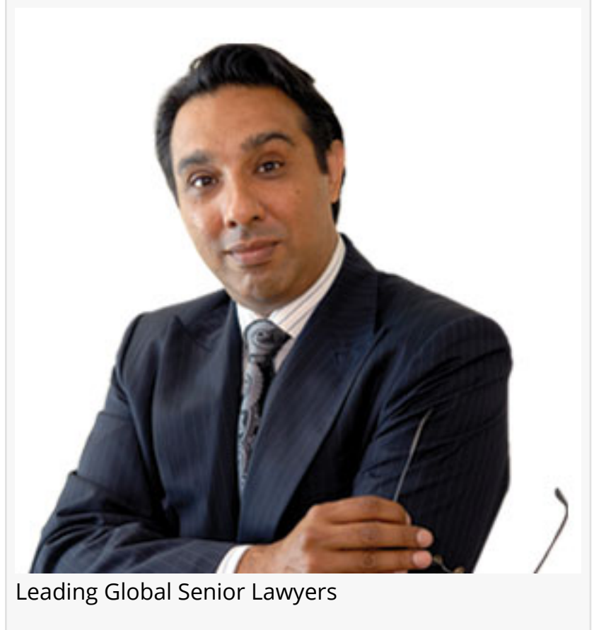
Leading Global Senior Lawyers